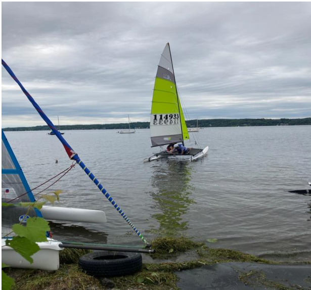
Multihull Open Regatta