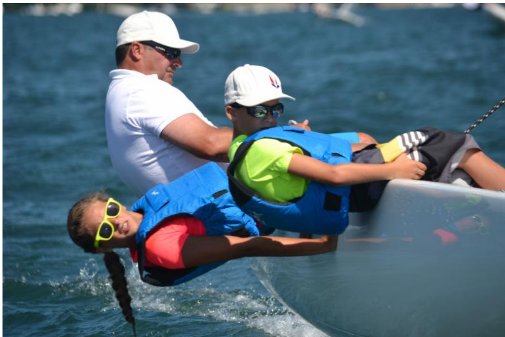
The Burdick team, always a favorite.