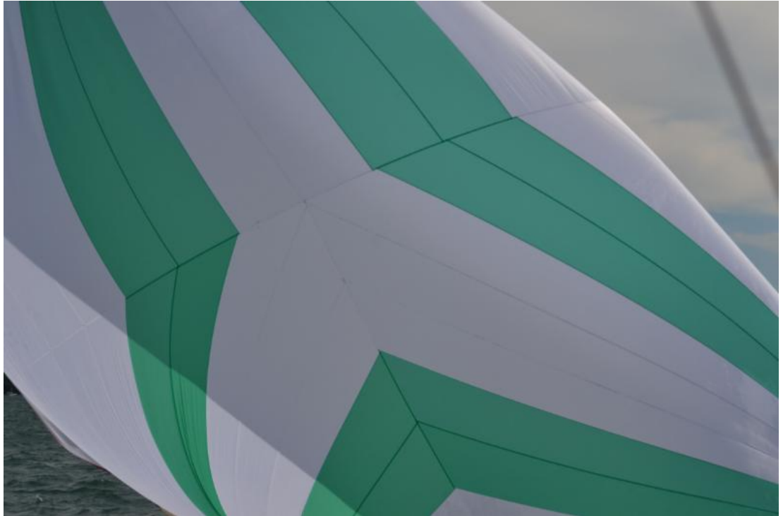
The view from the race committee boat. Yes, they were this close.