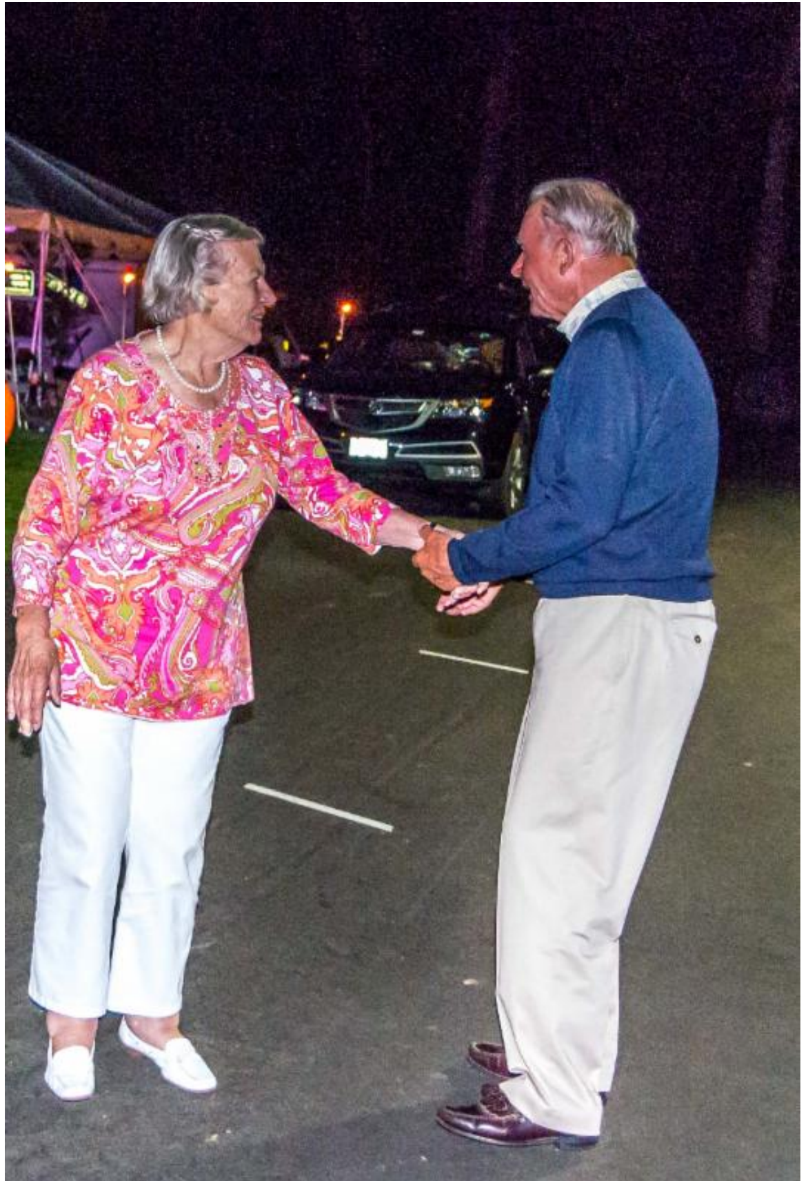
Lake Geneva royalty and our treasures, Gloria and Buddy Melges have graced us all week. He gives us the spirit that defines who we are in the Inland. Gloria's graciousness is ever present. Thanks, Buddy and Gloria.