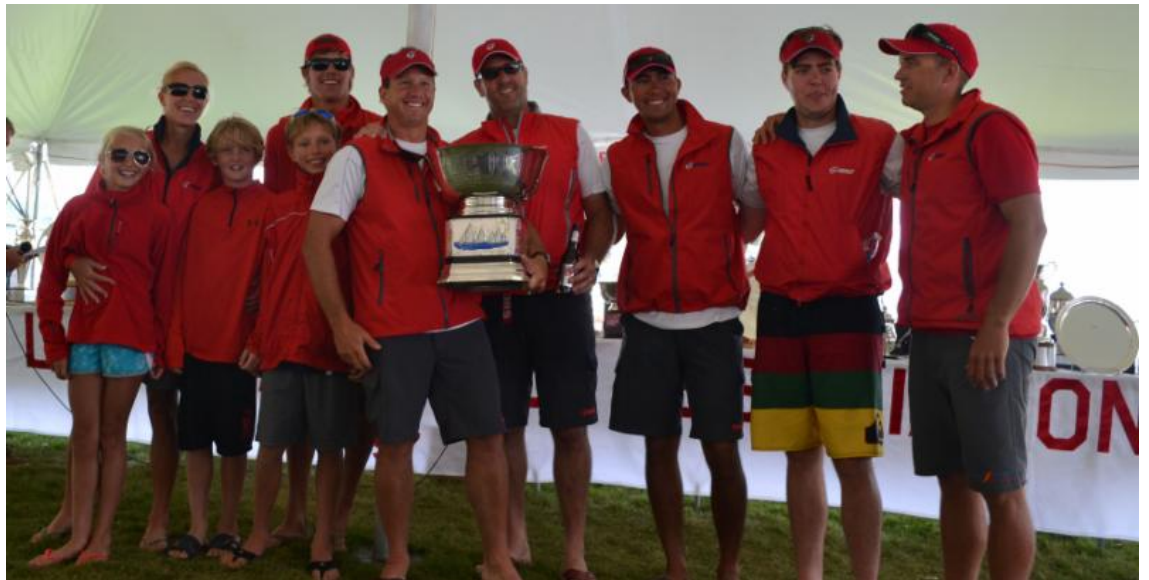
The G Force won the last race. Smiles, smiles, smiles