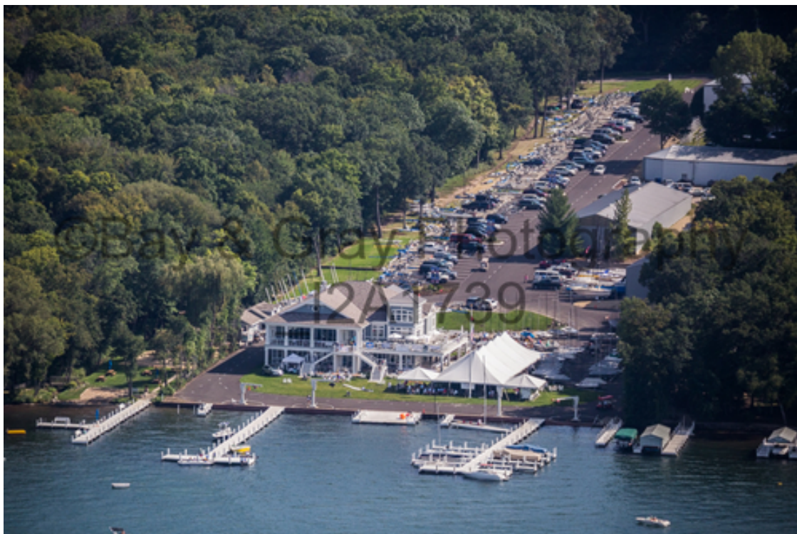
Buddy Melges Sailing Center

The Inland Lake Yachting Association thanks Lake Geneva Yacht Club from the depths of our hearts. Your club's dedication to completing a nearly insurmountable task is a gift to the sailing community that will withstand time. You are the origin of memories made to be cherished. Thank you.