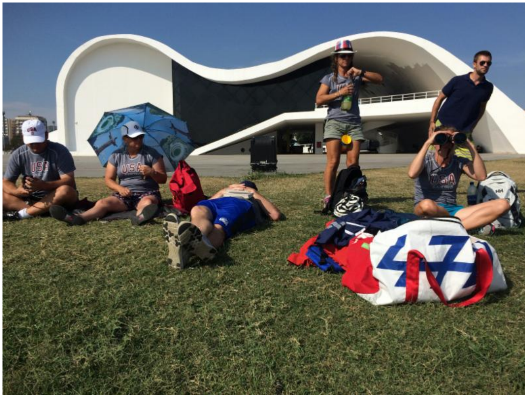
(Editor's son-in-law standing far right - who knew he liked sailing? He's one of us now).

Getting our priorities straight, we go to order beer. Alas, the bar is closed on Tuesdays. Who does that?