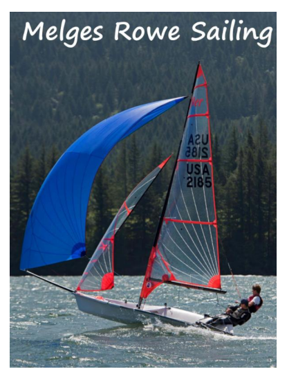
Melges Rowe - Donate here