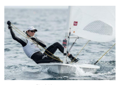
BowersSailing Donate Here