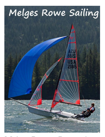
Melges Rowe - Donate here