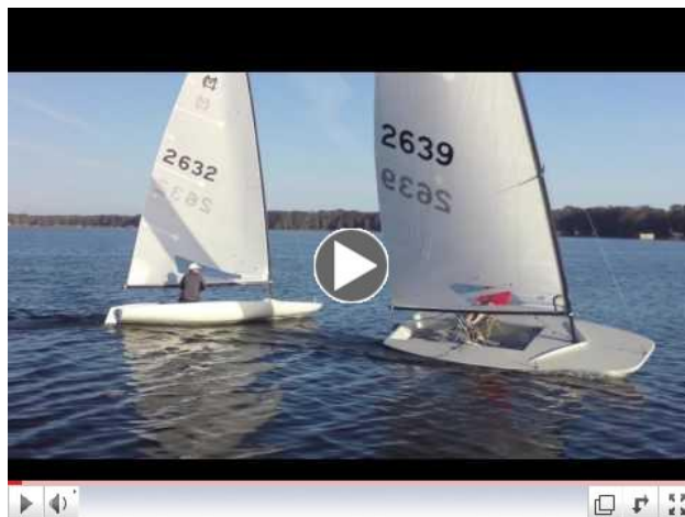
Melges MC video - get ready for the season