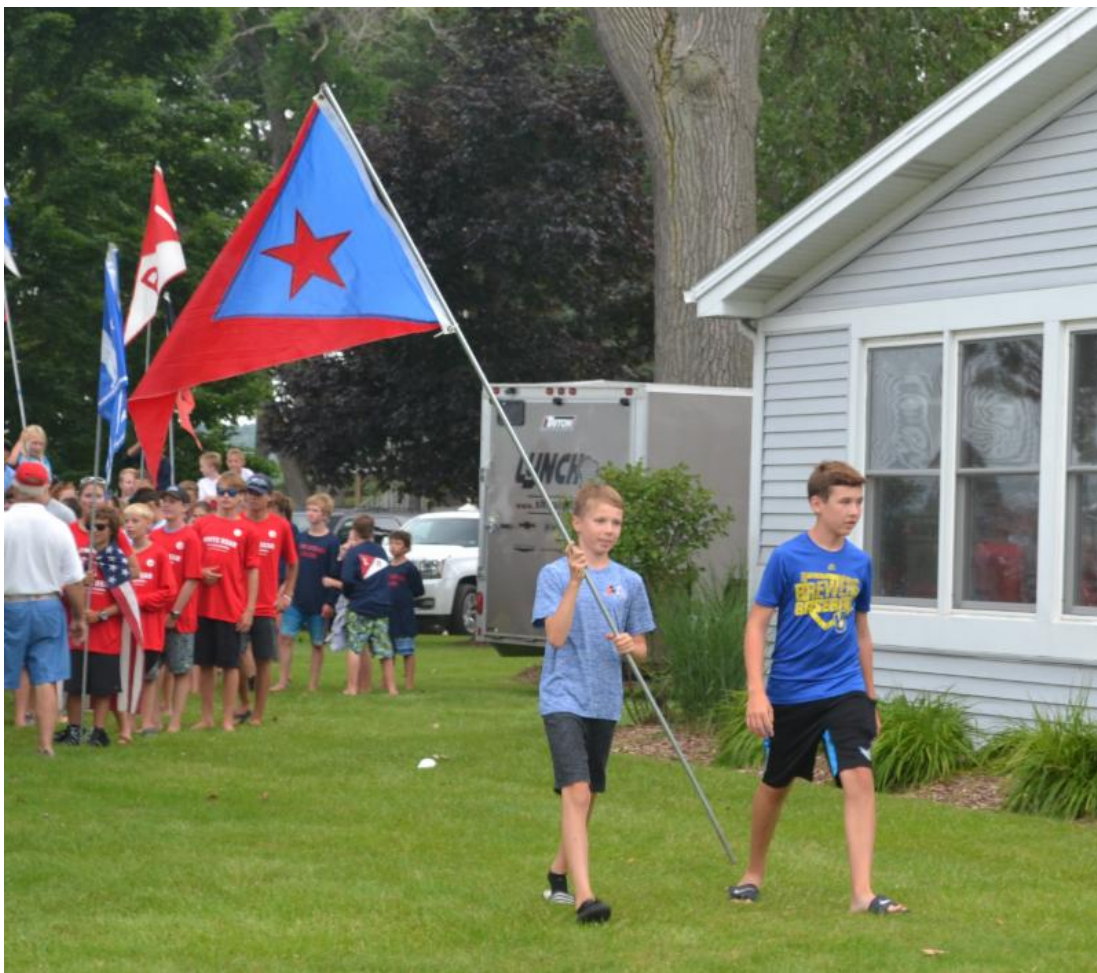
Perhaps the loudest applause was for Mendota_