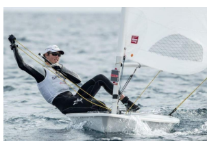
BowersSailing Donate Here