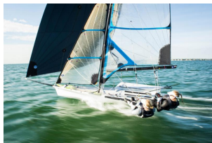
Roble Shea - Donate here Visit us on Facebook Visit our website