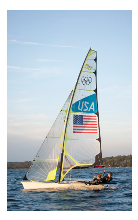
Melges Rowe - Donate here Visit us on Facebook Visit our Website