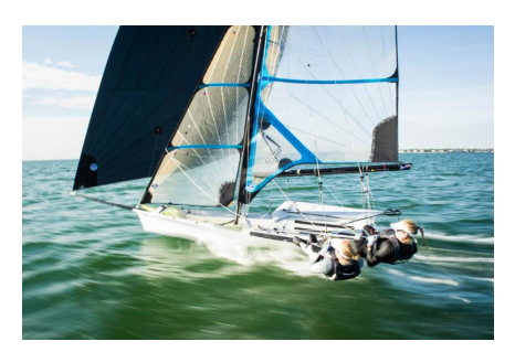
Roble Shea - Donate here Visit us on Facebook Visit our website

Race Committee and Judges Courses - Sign up now!