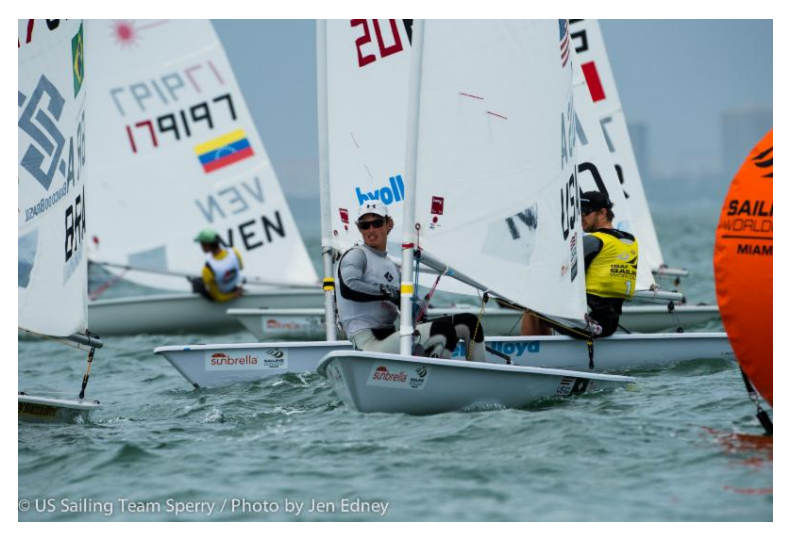
By Erik Bowers

After much thought and analysis, I've decided to end my Tokyo 2020 Olympic Campaign. Neither the Lauderdale Regatta nor Sailing World Cup