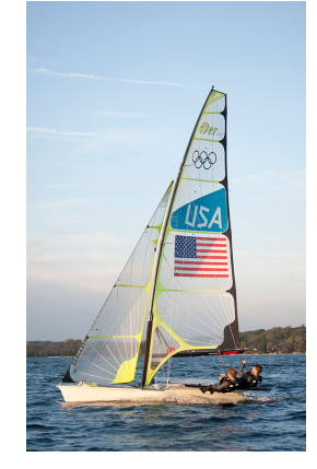
<u>Melges Rowe - Donate here</u> <u>Visit us on Facebook</u> <u>Visit our Website</u>