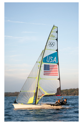
<u>Melges Rowe - Donate here</u> <u>Visit us on Facebook</u> <u>Visit our Website</u>

Roble Shea - Donate here <u>Visit us on Facebook</u> <u>Visit our website</u>