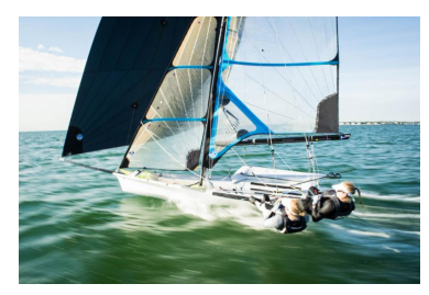
Roble Shea - Donate here Visit us on Facebook