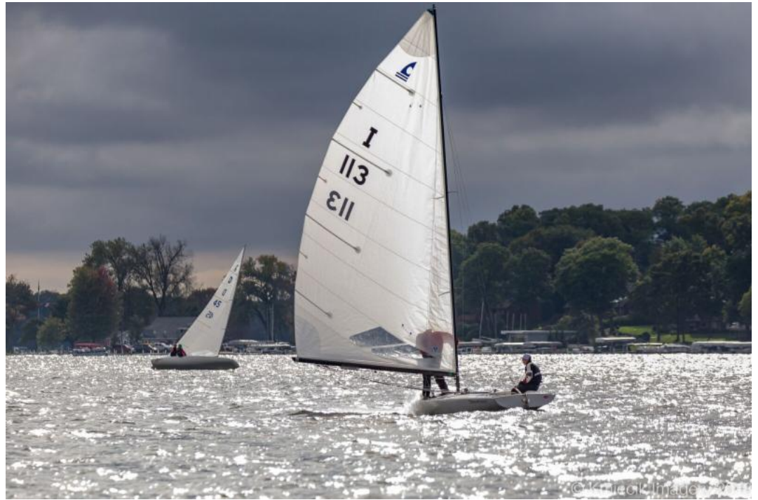
Dark, low hanging clouds reigned all weekend