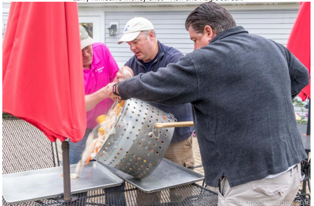
It's a Fish Boil on Saturday night - The local Delavan members were on the water during the day and cooked at night. Thanks, Delavan.