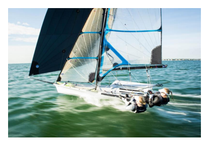
Roble Shea - Donate here