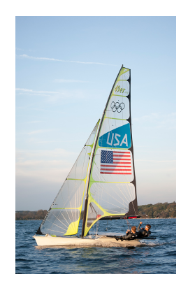
Melges Rowe - Donate here Visit us on Facebook Visit our Website