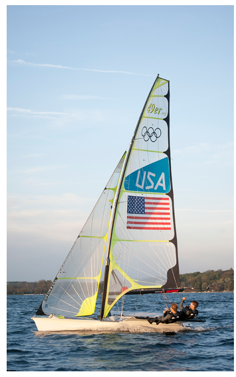
Melges Rowe - Donate here Visit us on Facebook Visit our Website