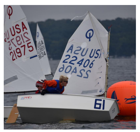
Go Chuck Go - Donate Here Visit me on Facebook