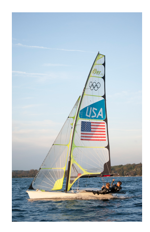
Melges Rowe - Donate here Visit us on Facebook Visit our Website