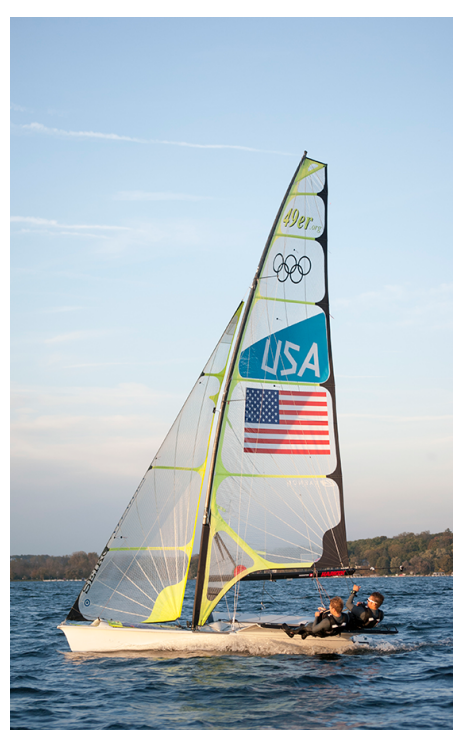
Melges Rowe - Donate here Visit us on Facebook Visit our Website