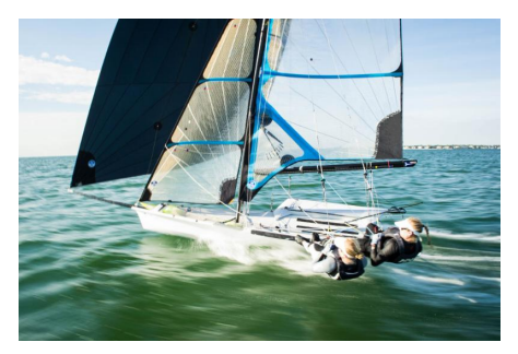
Roble Shea - Donate here Visit us on Facebook Visit our website