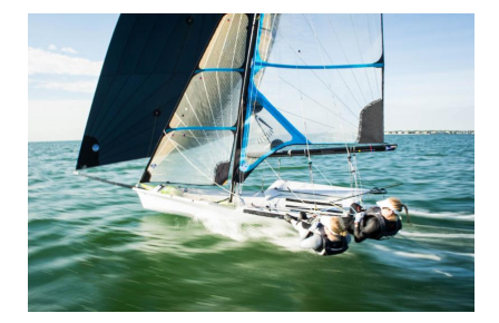
Roble Shea - Donate here <u>Visit us on Facebook</u> <u>Visit our website</u>