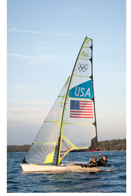
Melges Rowe - Donate here Visit us on Facebook Visit our Website