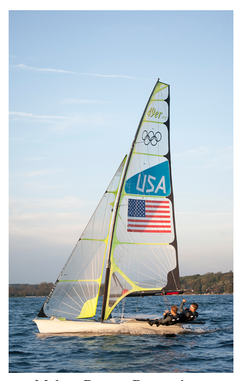
Melges Rowe - Donate here Visit us on Facebook Visit our Website