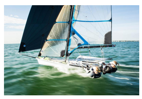
Roble Shea - Donate here Visit us on Facebook Visit our website