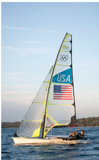
Melges Rowe - Donate here Visit us on Facebook Visit our Website