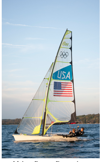
Melges Rowe - Donate here Visit us on Facebook Visit our Website