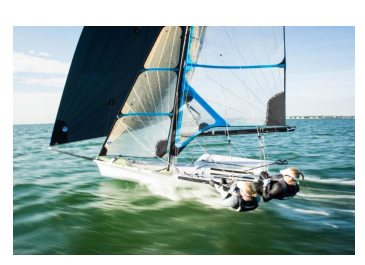
Roble Shea - Donate here Visit us on Facebook Visit our website