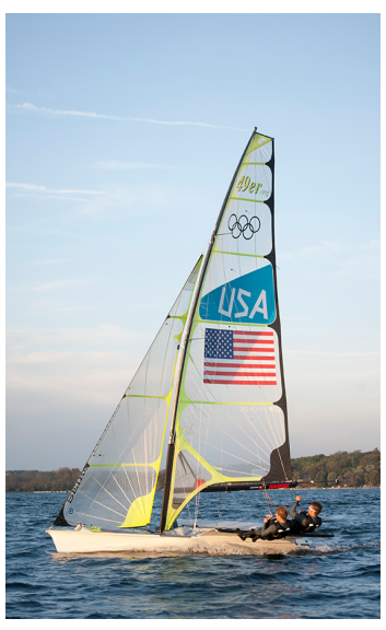
Melges Rowe - Donate here Visit us on Facebook Visit our Website