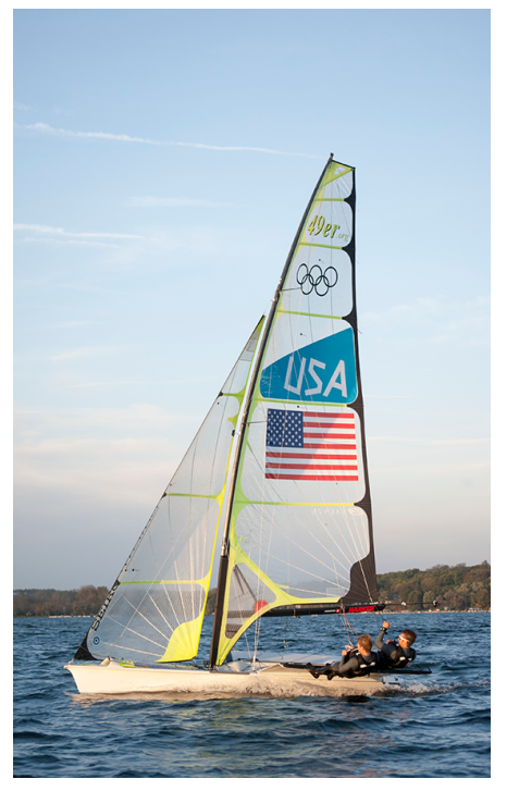
<u>Melges Rowe - Donate here</u> <u>Visit us on Facebook</u> <u>Visit our Website</u>