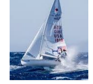
Perfect Vision - Donate here Visit us on Facebook Visit our website