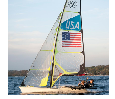
Melges Rowe - Donate here Visit us on Facebook Visit our Website