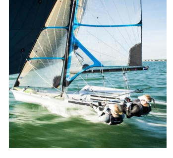
Roble Shea - donate Here Visit us on Facebook Visit our Website