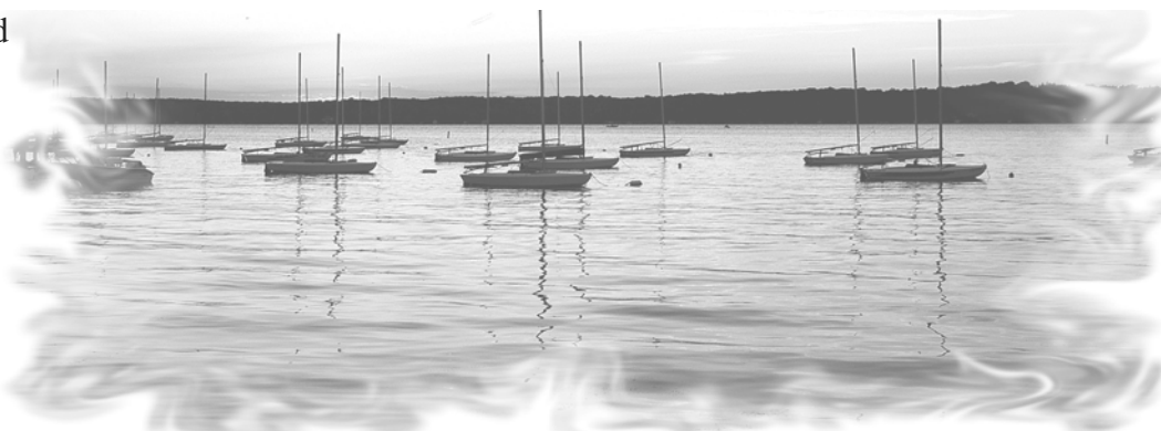
At the end of the day, all is calm.