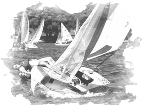
Top female skipper, Shannon Smith, struggled breeze on.

Pewaukee Lake is very shifty and challenging, with fifteen to twenty five degree shifts the norm.