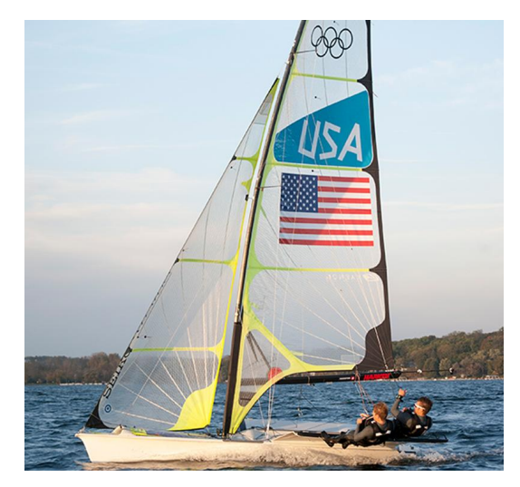
Melges Rowe - Donate here Visit us on Facebook Visit our Website

Click the links below, or donate through the ILYA