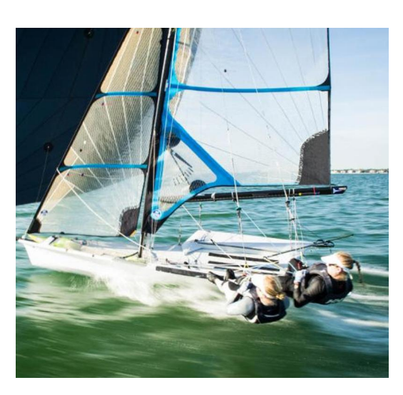
Roble Shea - Donate here Visit us on Facebook Visit our website