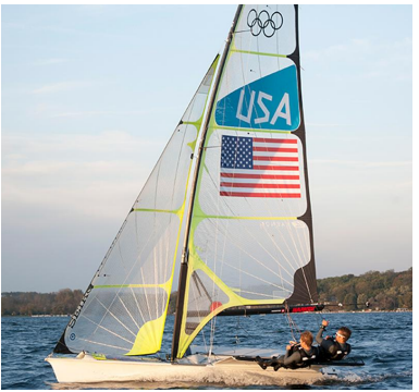
Melges Rowe - Donate here Visit us on Facebook Visit our Website