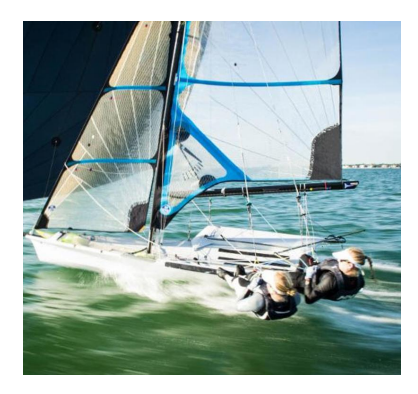
Roble Shea - Donate here Visit us on Facebook Visit our website