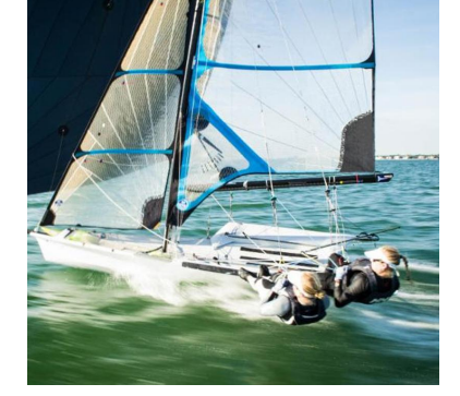
Roble Shea - Donate here Visit us on Facebook Visit our website