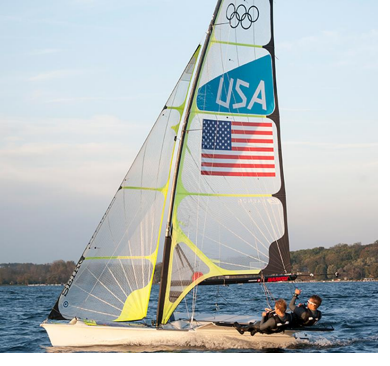
Melges Rowe - Donate here Visit us on Facebook Visit our Website