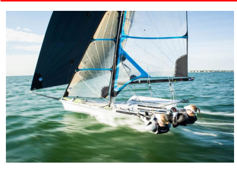
Roble Shea - Donate here Visit us on Facebook Visit our website