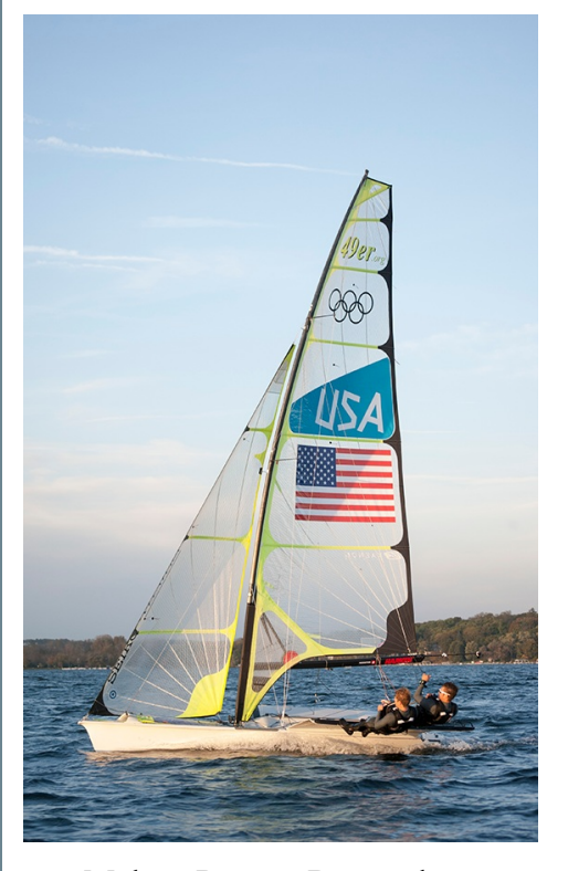
Melges Rowe - Donate here Visit us on Facebook Visit our Website