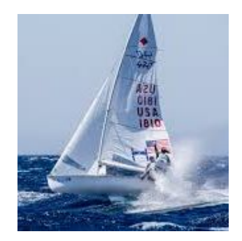
Perfect Vision - Donate here Visit us on Facebook Visit our website