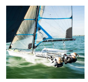
Roble Shea - donate Here Visit us on Facebook Visit our Website