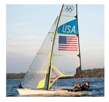
Melges Rowe - Donate here Visit us on Facebook Visit our Website

Click the links below, or donate through the ILYA