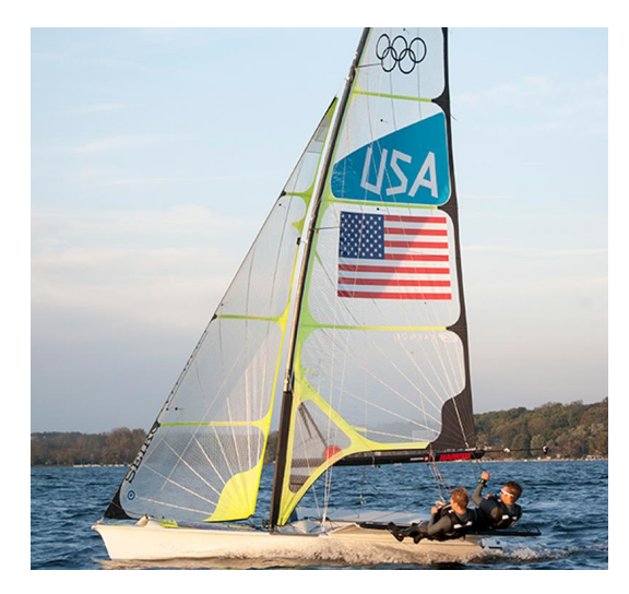
Melges Rowe - Donate here Visit us on Facebook Visit our Website