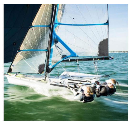
Roble Shea - Donate here Visit us on Facebook Visit our website