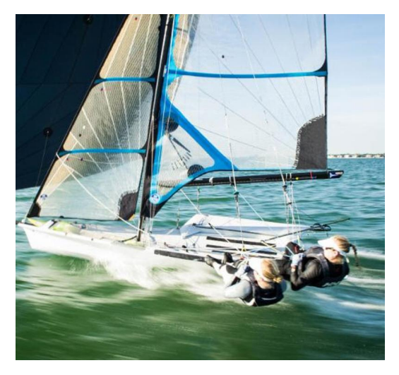
Roble Shea - Donate here Visit us on Facebook Visit our website