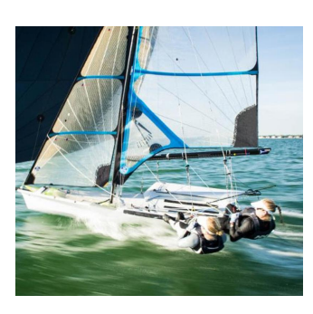
Roble Shea - donate Here Visit us on Facebook Visit our Website