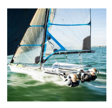
Roble Shea - donate Here Visit us on Facebook Visit our Website