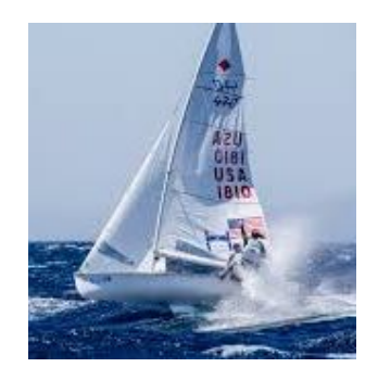
Perfect Vision - Donate here Visit us on Facebook Visit our website