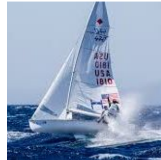
Perfect Vision - Donate here Visit us on Facebook Visit our website