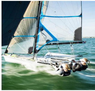
Roble Shea - donate Here Visit us on Facebook Visit our Website