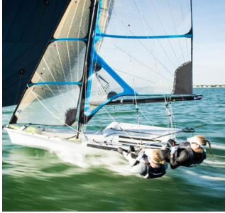
Roble Shea - donate Here Visit us on Facebook Visit our Website