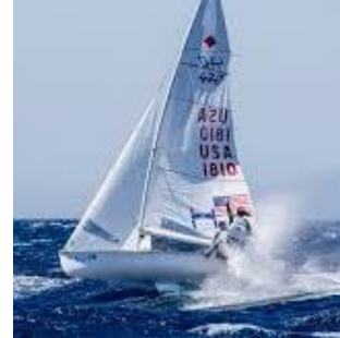
Perfect Vision - Donate here Visit us on Facebook Visit our website