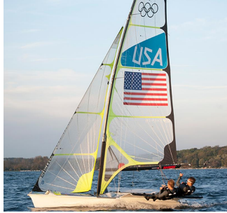
Melges Rowe - Donate here Visit us on Facebook Visit our Website