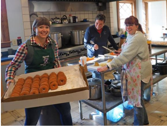
Docks Out Work Party