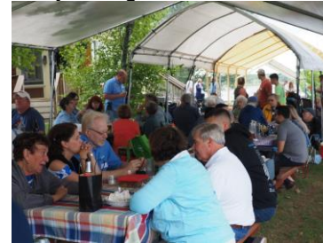
Labor Day Lobster Boil