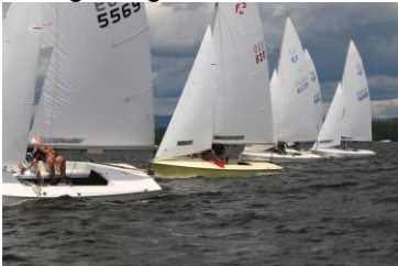
Flying Scot Regatta