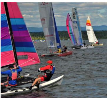
Multi-Hull Open Regatta