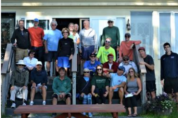
Multi-Hull Open Regatta