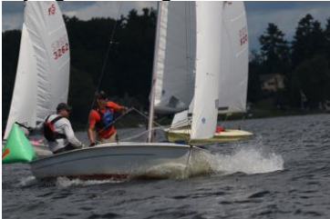
Flying Scot Regatta