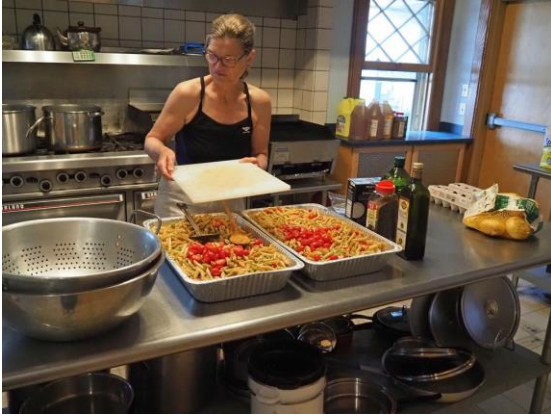
July 4 th BBQ