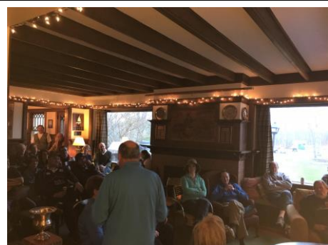
Sailing Program Meeting