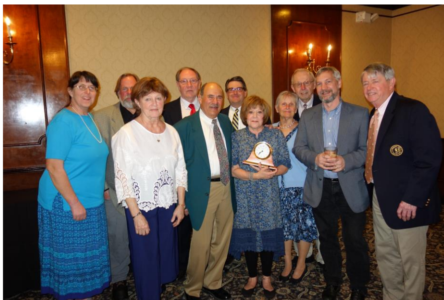
Mary Elizabeth Hull Award Winners

The Approach & Rescue Process Starting an Evening Program for Cruisers On Thursday Evenings Q & A Session