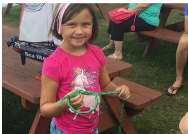
Square knot perfected.

These efforts, weather-permitting, take place Mondays in August. If you are interested in supporting please contact Skip Parry at skisure64@nycap.rr.com .