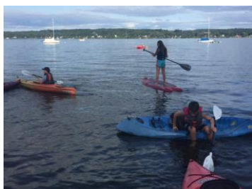
What do we do when there's no wind?