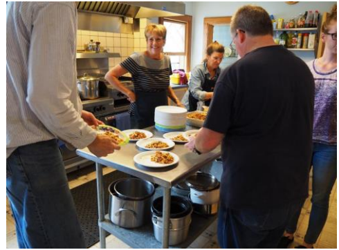
2017 Spring Work Party pictures to get us in the mood!

Details are in the March issue House Report on Page 3.