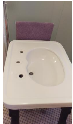
Not Much Left