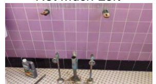
90 Years Later