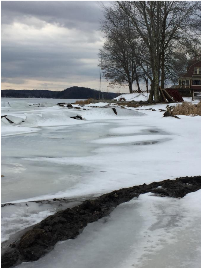
Lake Ice at the Club