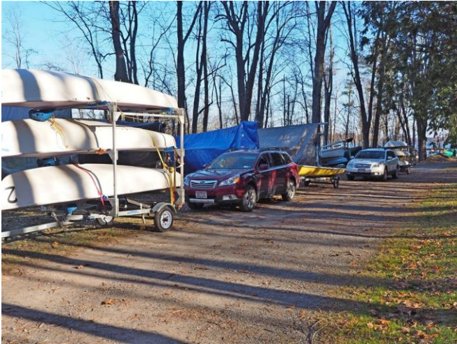
Fall Boat-Moving Party