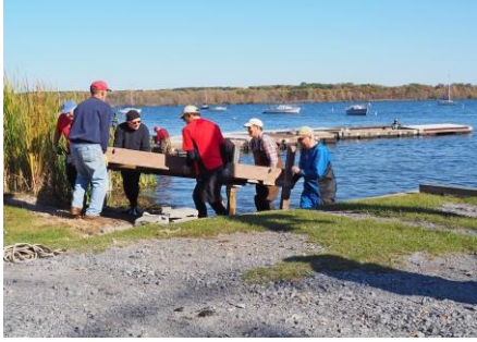
Fall Work Party