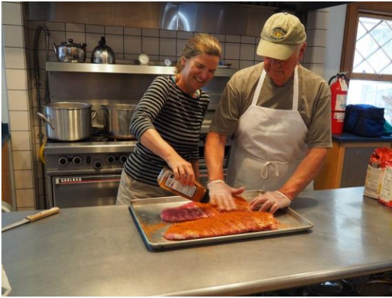
July 4 th BBQ