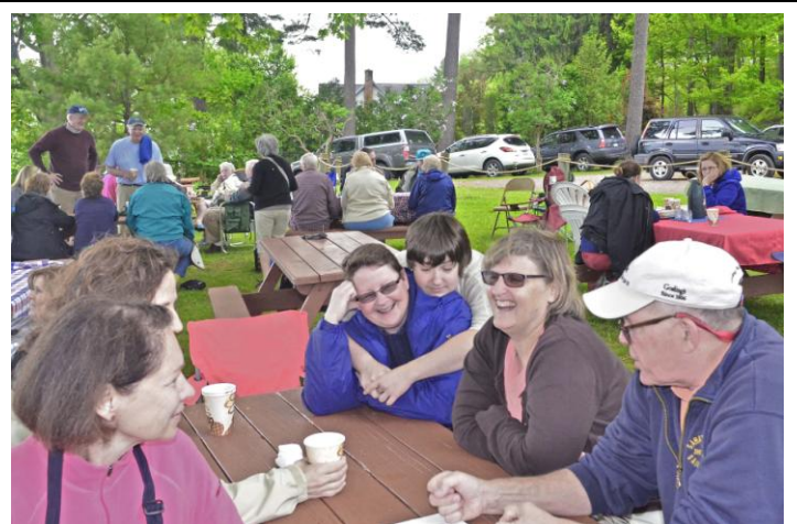
Candid Photo by Hunter

In the spring, a celebration of Hunter's life will be held at SLSC. Details will be posted on the website and shared in the Telltale when available.