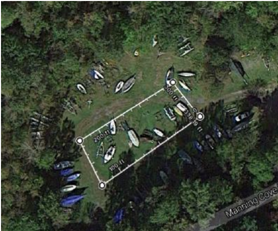
Outlined area to be empty

2. Relocate all of the boats and trailers that are in the center of the meadow to prepare for gravel.